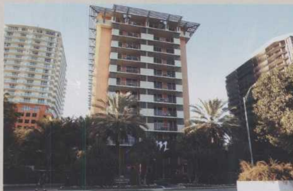
■ The Mutiny condo-hotel in Coconut Grove.